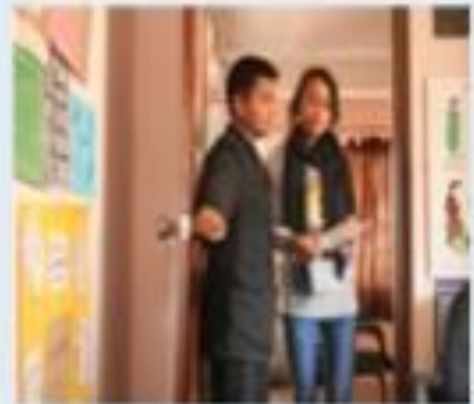
Art Workshop moments captured