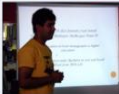
Presenting About Self