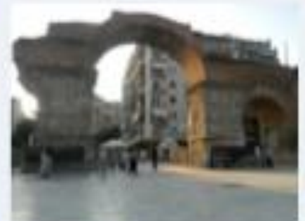
Museum of Roman Agora, Red tower and Kamara of Thessaloniki