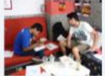
Group assignment and Certificate distribution Ceremony during "Creative Writing Workshop"