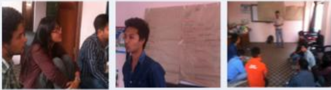
Participant involvement in Peer Education Training