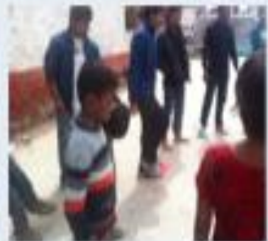
Playing Traditional Games