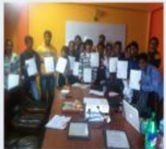
Glimpses of Youth Conference